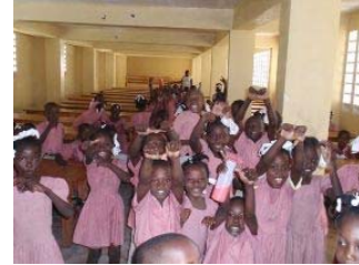
Children coming out of the lunch room at Blanchard Church School.